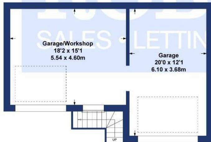
GROUND FLOOR (OUTBUILDING)